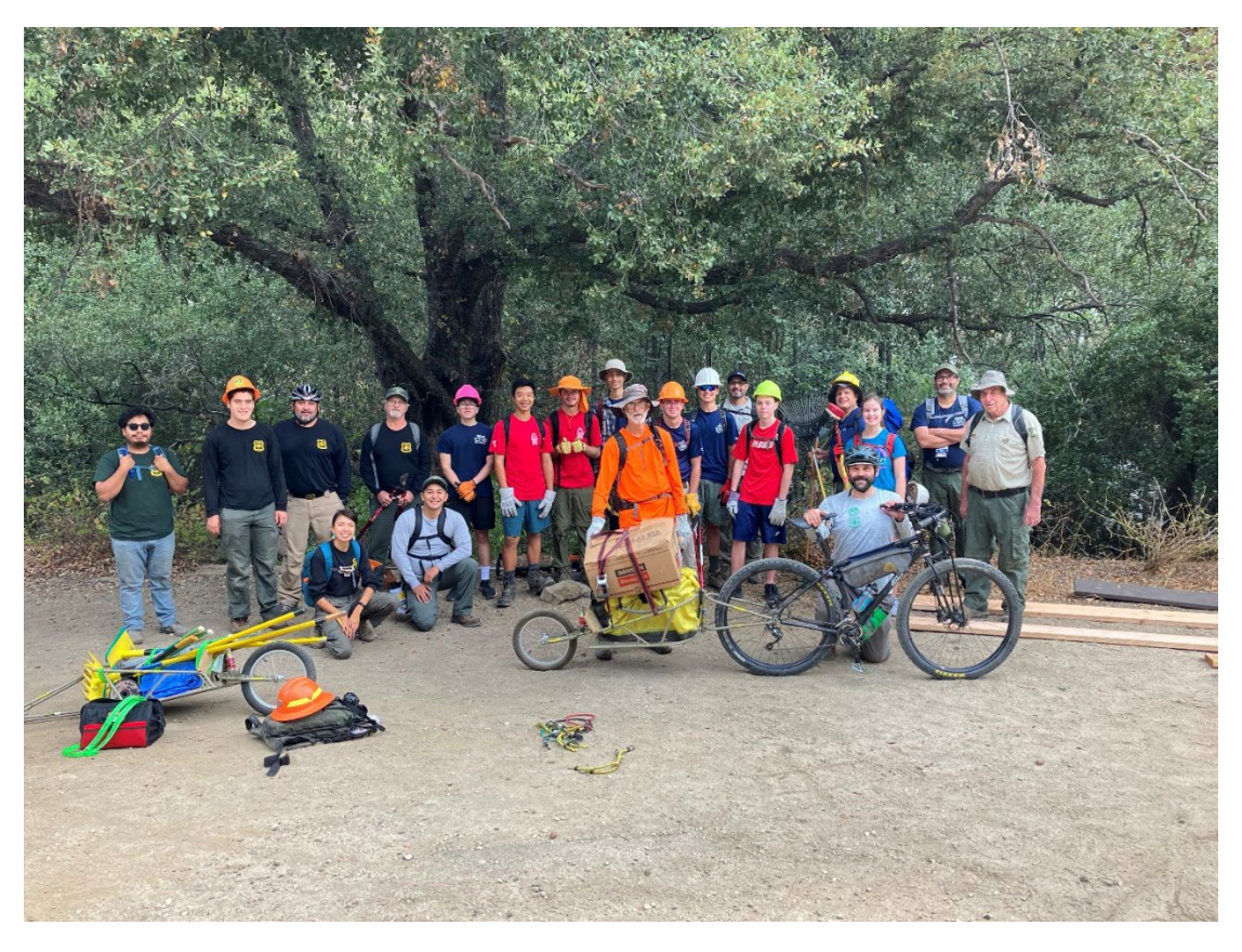
Day 1 crew assembled for the hike from Gould Mesa Campground to Paul Little Picnic Area.