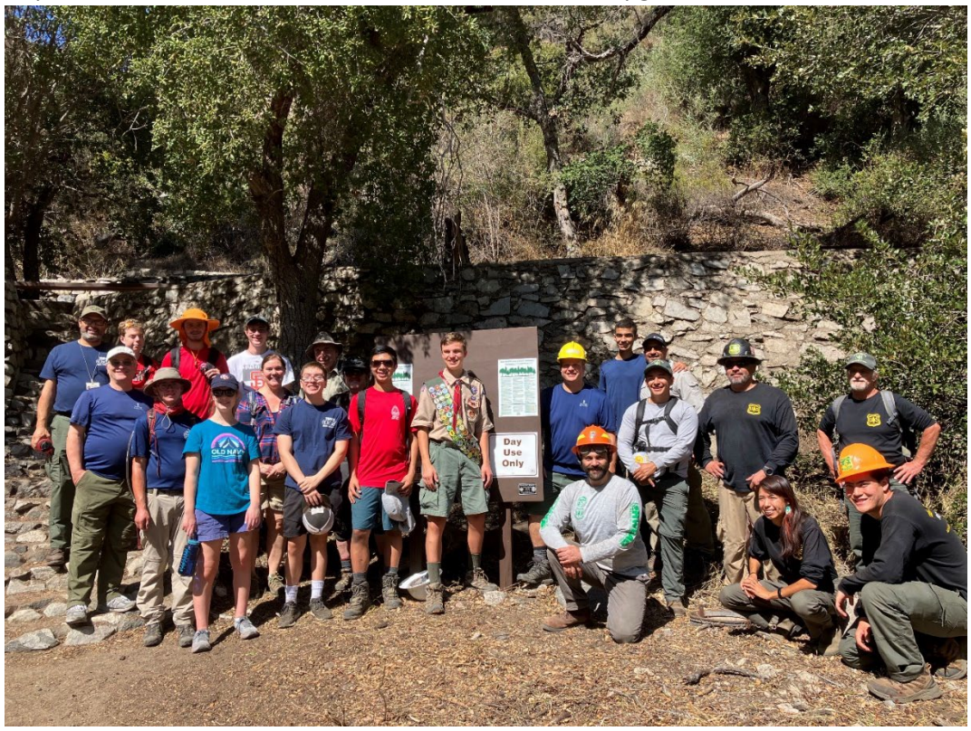
Day 1 crew celebrating rehabilitation of the Paul Little Picnic Area.