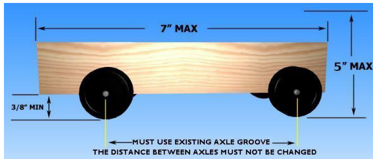
Figure 2 - Length, Height, Wheelbase, & Clearance Requirements